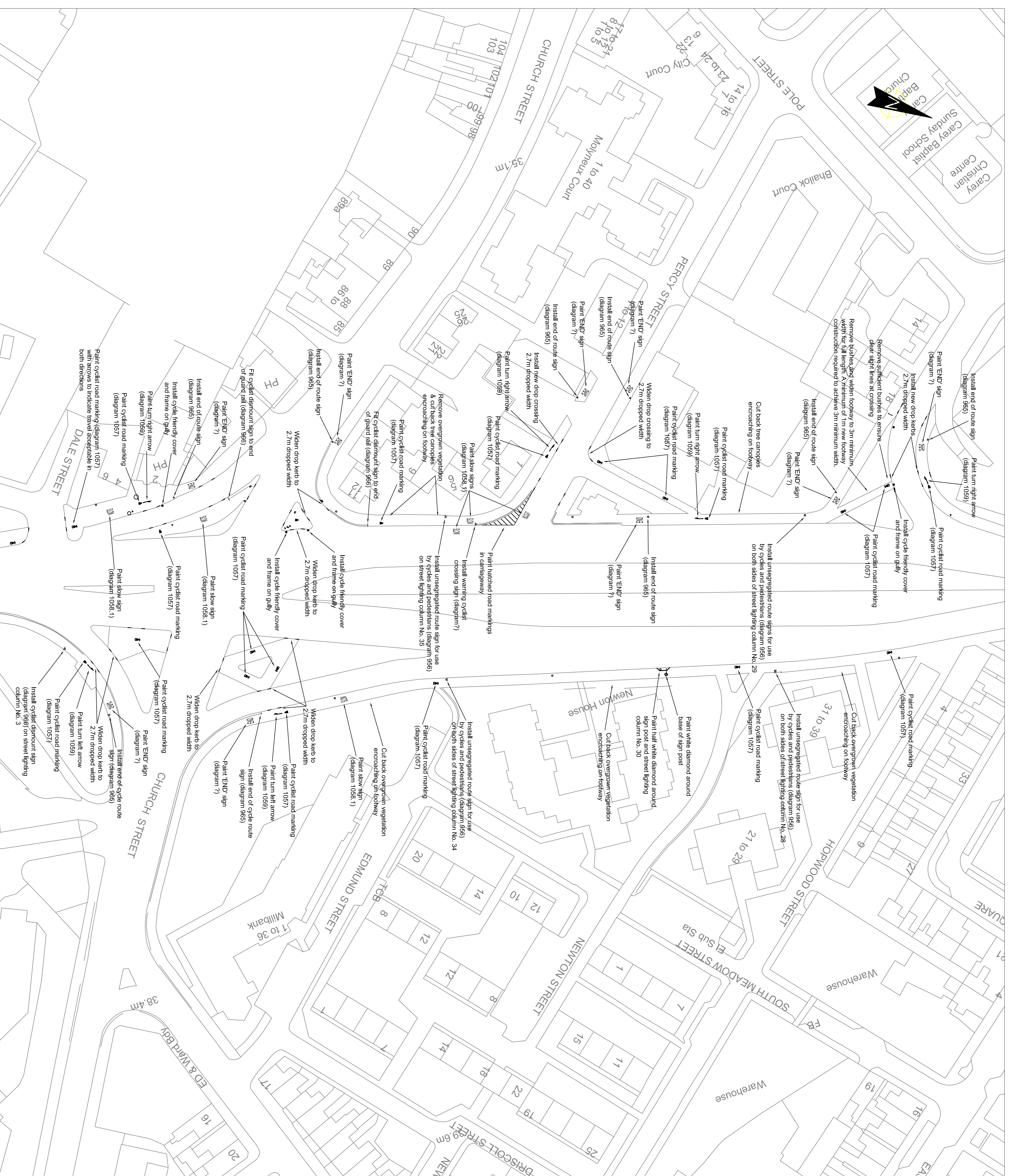
General Arrangement Scale 1:500